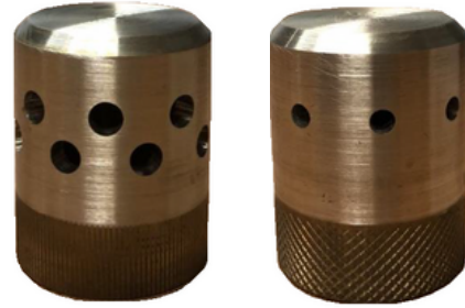
Chemical Nozzle 360° & 180°